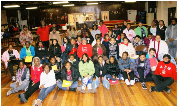
Delta Academy Girls and Leaders during Retreat

The Annual Leadership Development Retreat was held November 5-7 th at Camp George Forbes. Delta Academy, in its 14 th year serving young ladies ages 11 to 14 in the Greater Cleveland Area was founded by Congresswoman Marcia L. Fudge during her tenure as the 21 st National President of the sorority. Her theme for the Academy: "Catching the Dreams of Tomorrow and Preparing African American Young Women for the Challenges of the 21 st Century".