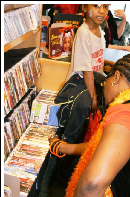
Students enjoyed visiting the on site Cleveland Public Library's traveling Bookmobile unit.