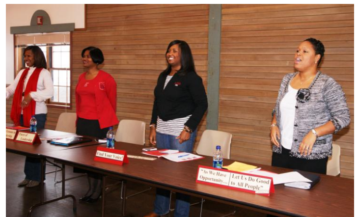
Leadership Retreat Panel Members