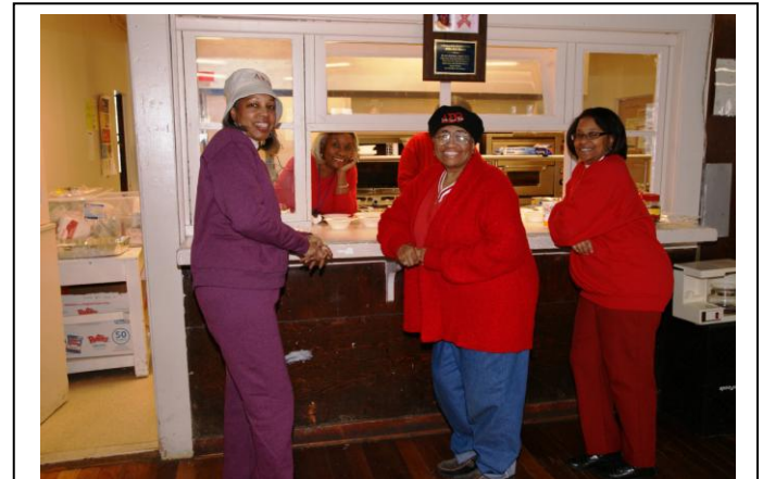
EMBODI Leadership Team