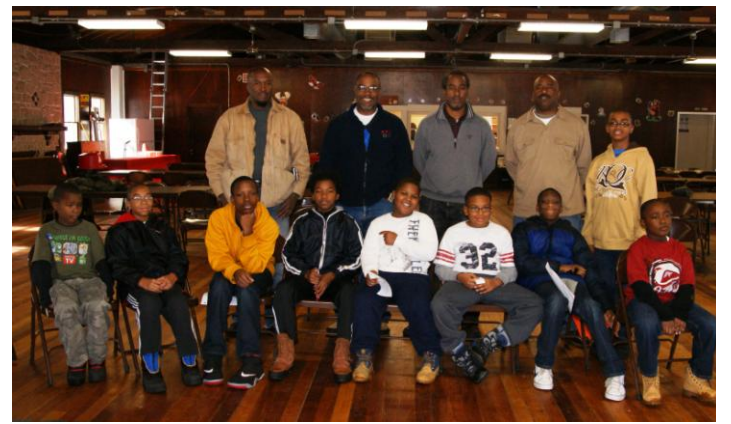
EMBODI participants with Male Leaders

challenges until parents arrived to take them home. By then, the weather was warm and sunny creating great melting pools of slushy water for EMBODI boys to get in their last splashes.