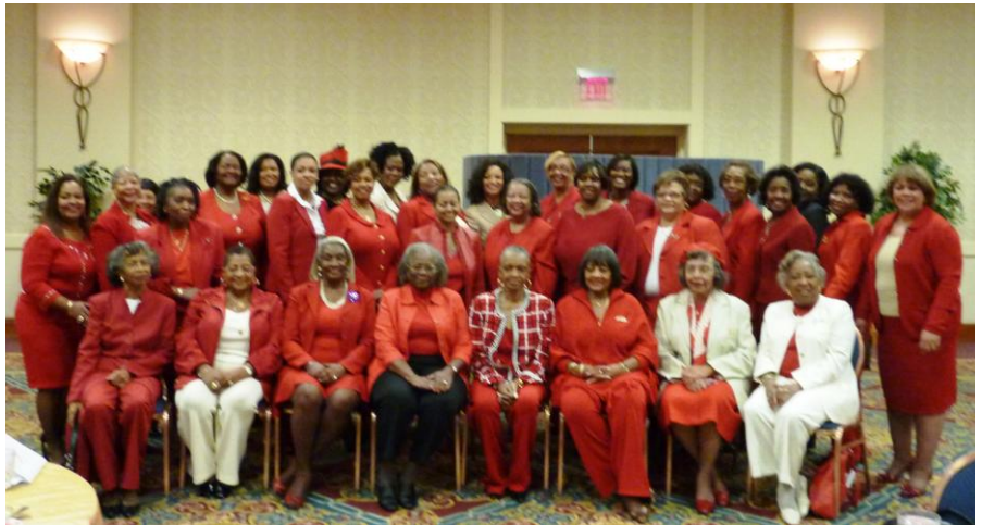
GCAC in Akron for their 50 th Anniversary

More than fifty members of Greater Cleveland Alumnae Chapter travelled south to celebrate Akron Alumnae Chapters' 50 th Anniversary during a lovely Crimson & Cream Luncheon. More than two-hundred and fifty members of Delta Sigma Theta Sorority and guests were present at the luncheon to share in the